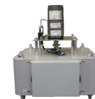
With Casing Terminal Covers